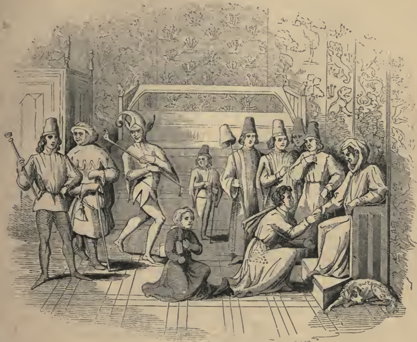
FROISSART AT THE COURT OF THE COUNT DE FOIX. From a MS. Froissart of the 15th century.

it most readily, saying, that the history I was employed on would in times to come be more sought after than any other; "because," added he, "my fair sir, more gallant deeds of arms have been performed within these last fifty years, and more wonderful things have happened, than for three hundred years before."